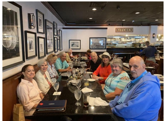
Pictured back wall. Front to back